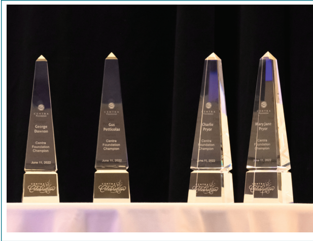
Centra Foundation Champion awards.