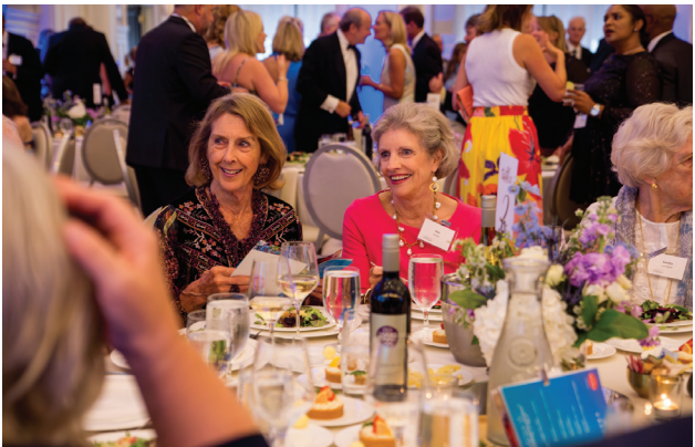
Guests enjoy socializing and a live auction.