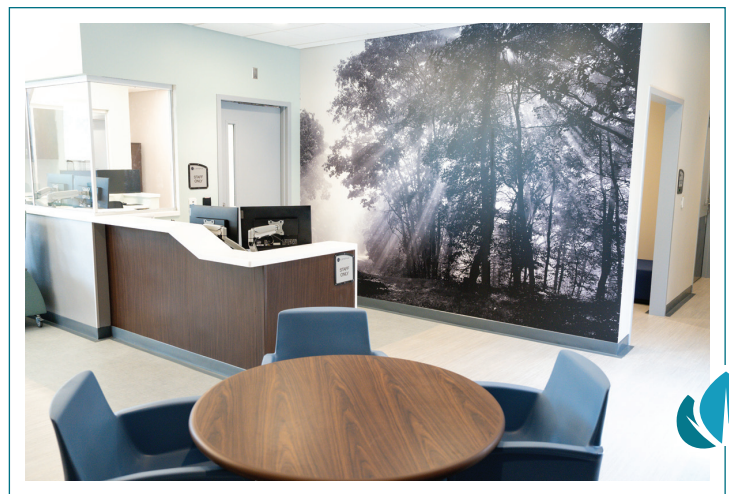
The new emPATH unit at Centra Lynchburg General Hospital

"We're pleased to be able to celebrate this opening during our 30th anniversary as we honor the incredible impact donors have had on healthcare for our local communities," she said. "This is a perfect example of how donor support can ignite a passion for change and a determination to find new ways and new models to care for patients."