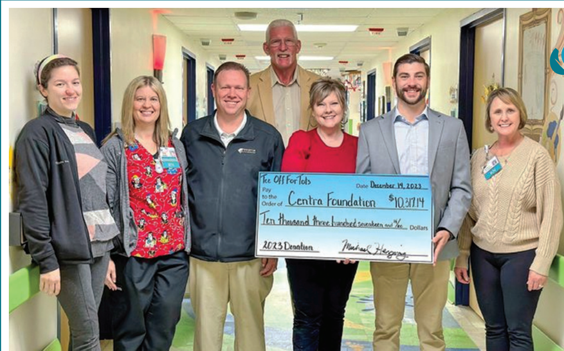
The organizers of the Tee Off for Tots Golf Tournament with Caregivers.