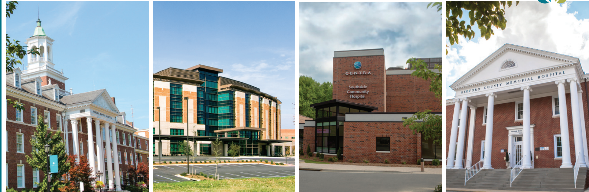
Centra Virginia Baptist Hospital, Centra Lynchburg General Hospital, Centra Southside Community Hospital, Centra Bedford Memorial Hospital